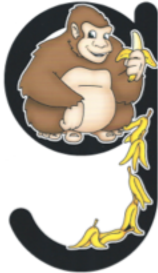
g - gentle gorilla Pretend you are a gorilla and give the sound "g".