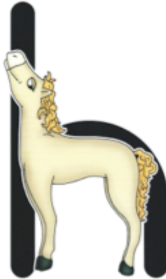
h - happy horse Pretend you are a galloping horse. When the sound of the horse is stopping the side of your height and give the sound "h".