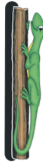
l - lily lizard Pretend you are a lizard. Give the sound "l".