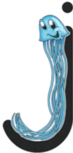
j - jelly jellyfish Pretend you are a jellyfish and give the sound "j".